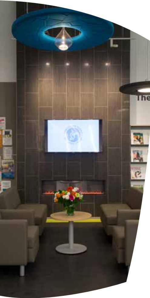
The refreshed Nanaimo Wellington branch