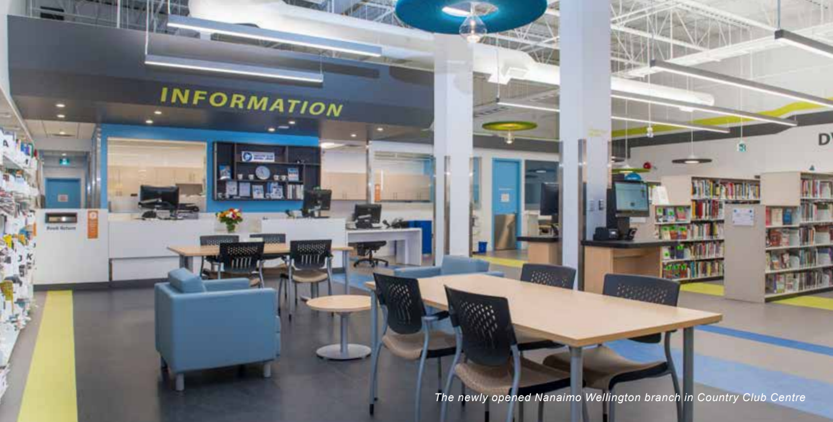
The newly opened Nanaimo Wellington branch in Country Club Centre