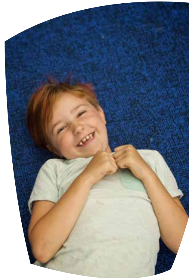
The Nanaimo Wellington branch was bustling with giggles and excitement during the official opening in July

The 2018 Budget ensures that VIRL will evolve and expand to meet the diverse needs of the communities we serve. The Budget supports the Board's Strategic Plan: Your Voice, Your Library, and reinforces the principles of the 15-year Consolidated Facilities Master Plan.