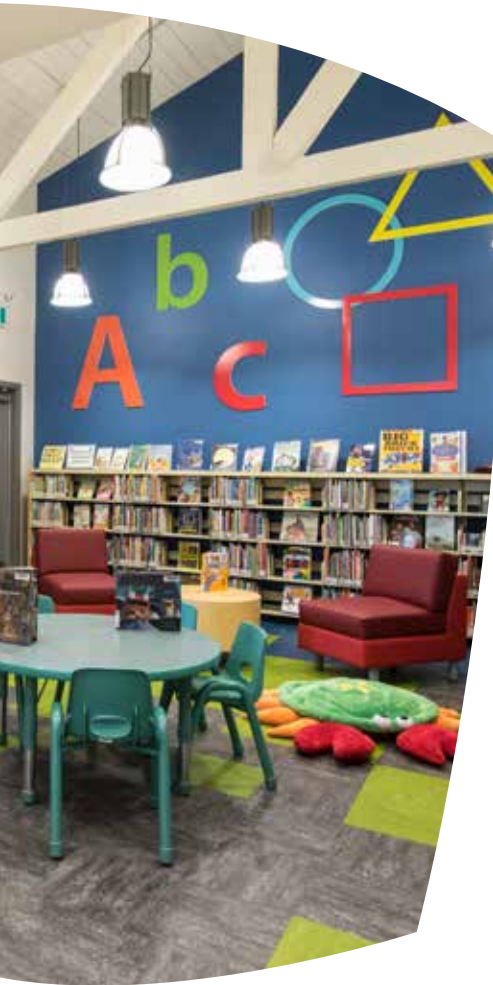
The refreshed Port Hardy branch