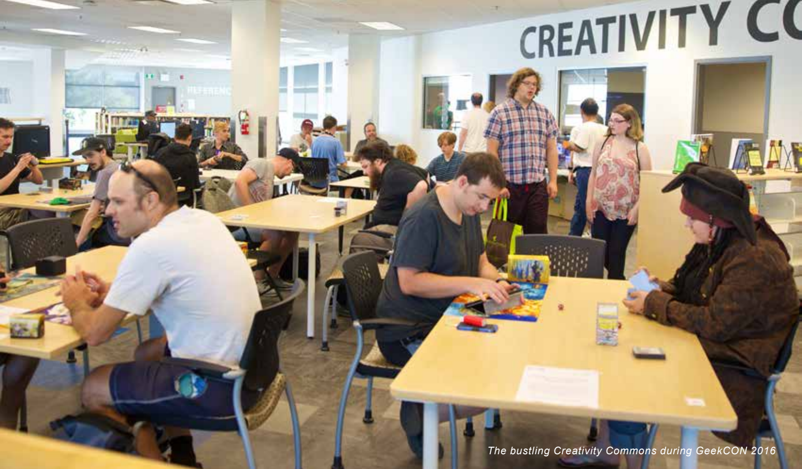
The bustling Creativity Commons during GeekCON 2016