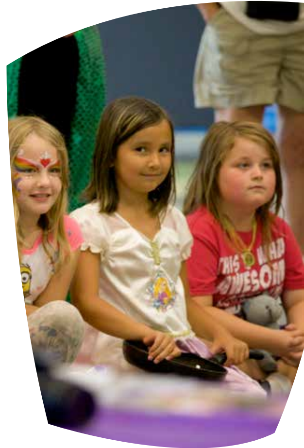
A first annual event, GeekCON 2016 drew hundreds to the Nanaimo Harbourfront branch, which combined comic culture with literacy.

The focus of the 2017 Budget is to ensure that VIRL continues to meet its service standards, and to incorporate the requirement to keep costs in line while meeting the needs of our communities. The 2017 Budget supports the Board's Strategic Plan: Your Voice, Your Library, and reinforces the principles of the 15-year Consolidated Facilities Master Plan .