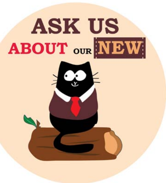
VIRL's new Integrated Library System (and cat-a-log)