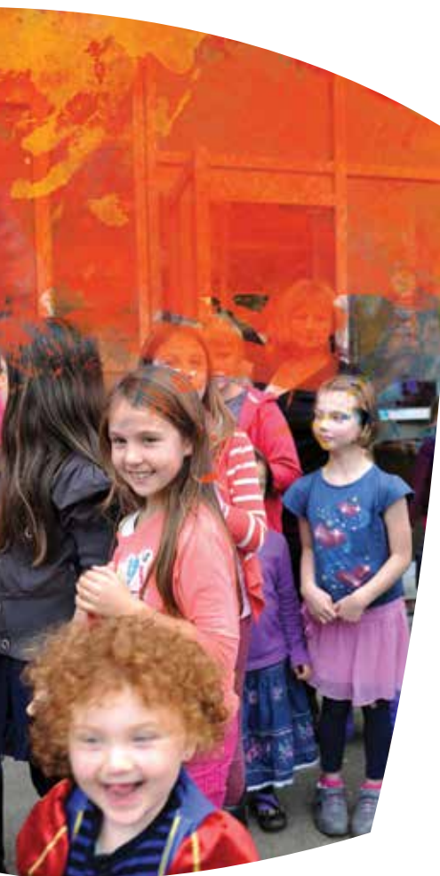
A celebration at the Cumberland branch