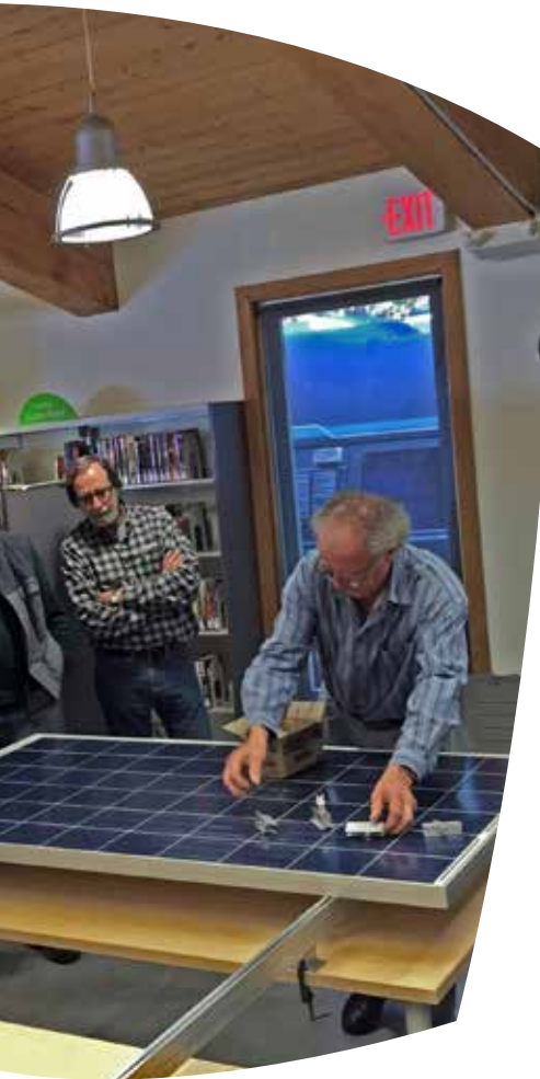
A DIY solar for your home program at the Gabriola Island branch.