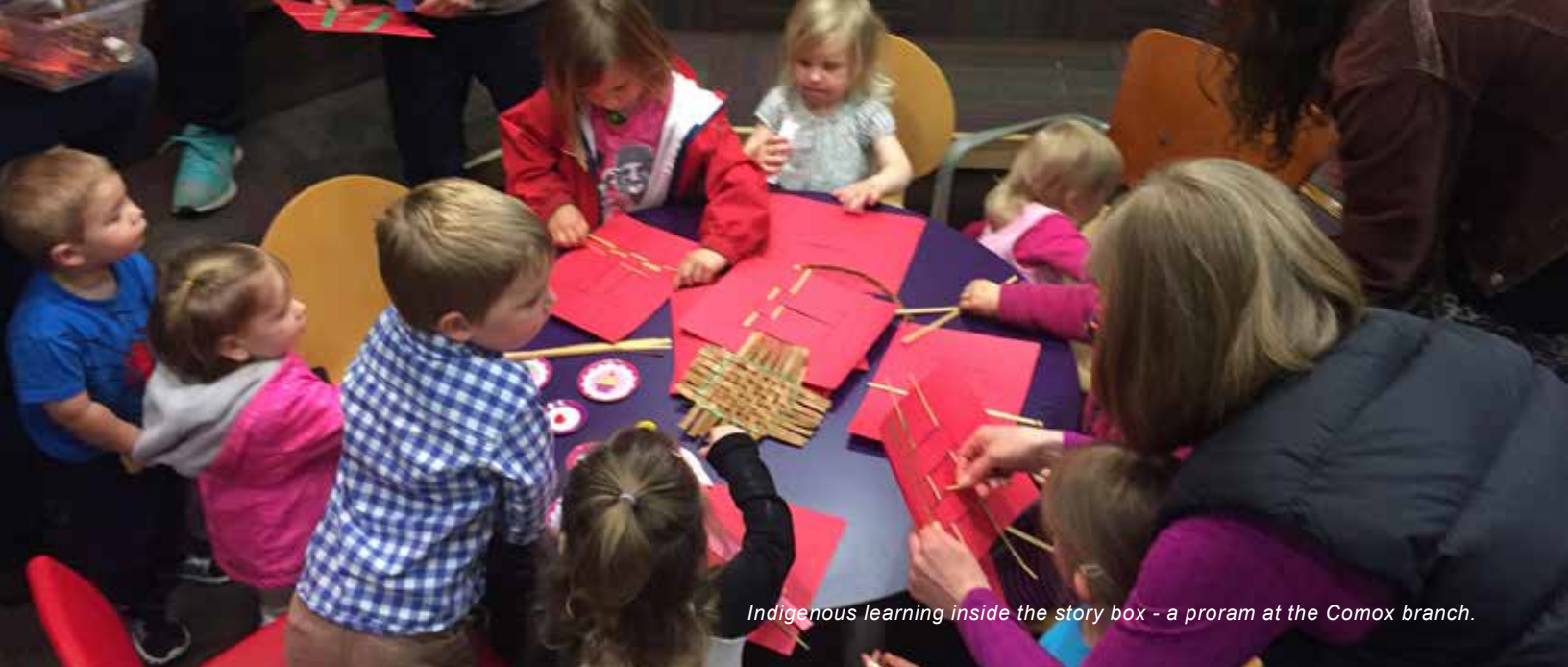
Indigenous learning inside the story box - a proram at the Comox branch.