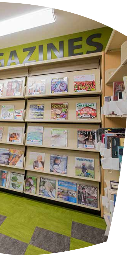
A new reading nook for the community of Hornby Island.