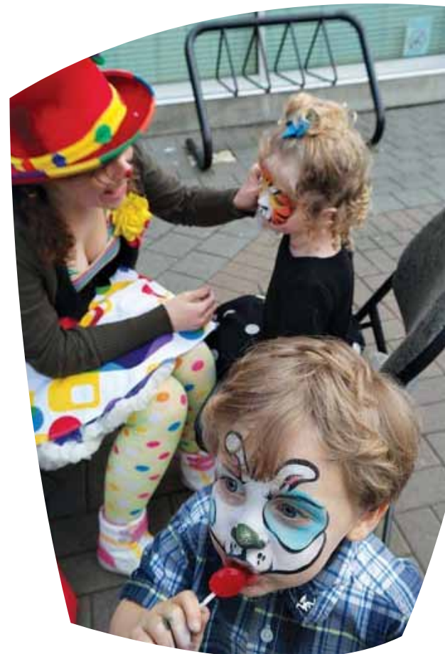
Family Literacy Day Community Celebrations

In the spirit of responsible spending and to ensure that staff salaries are comparative to industry standards, the Board has approved a salary survey review by an independent contractor. The Chair and Director of Human Resources will report the results and bring recommendations to the Board of Trustees for review, following the award of the contract.