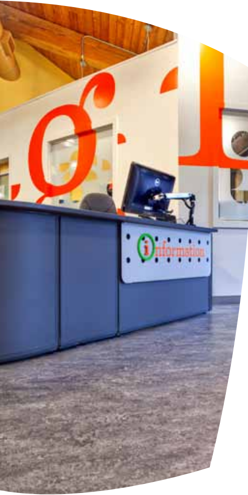
Gabriola Island Branch, Entrance Area